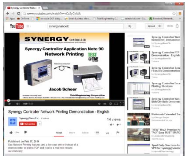
The same video viewed on the PC