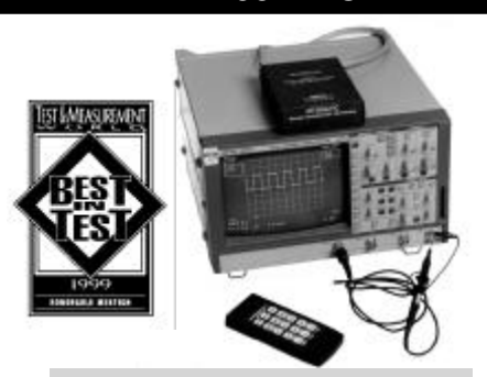
Recognized in Test and Measurement World Magazine "Best in Test 1999" Awards

Infrared Remote Control any IEEE488 instrument(s) from a distance of 30 ft.